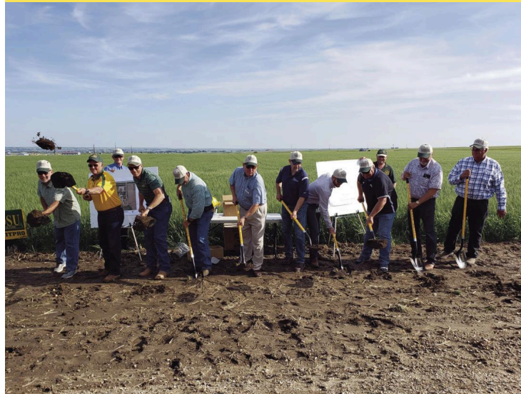
Williston: Seed Cleaning Plant

MWEC Mountrail-Williams Electric Cooperative