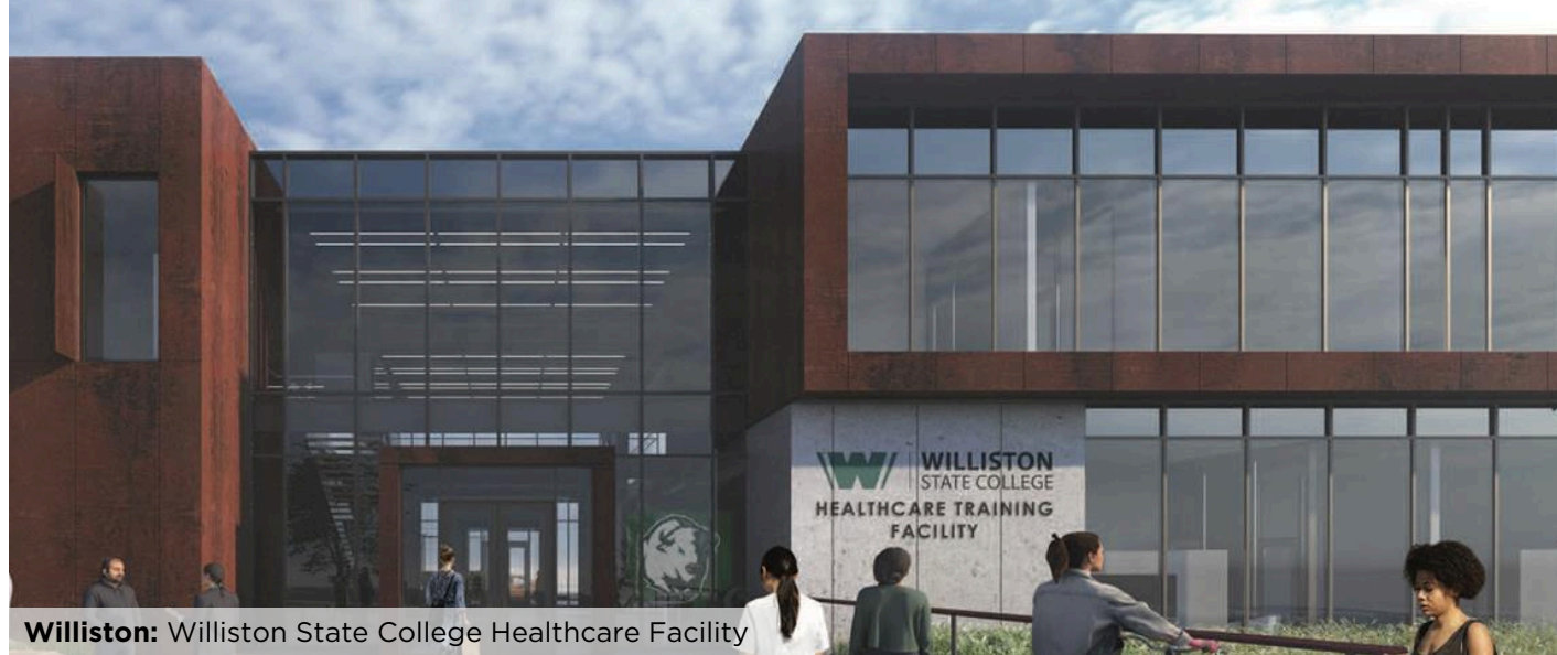
Williston: Williston State College Healthcare Facility