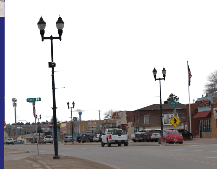
New Town: Main Street Light Project