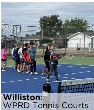
Williston: WPRD Tennis Courts