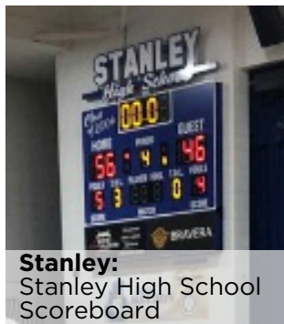
Stanley: Stanley High School Scoreboard